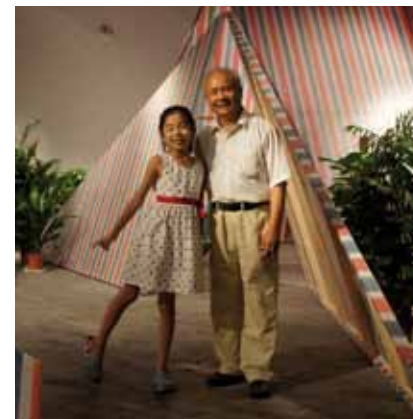
Niece & Uncle 侄舅