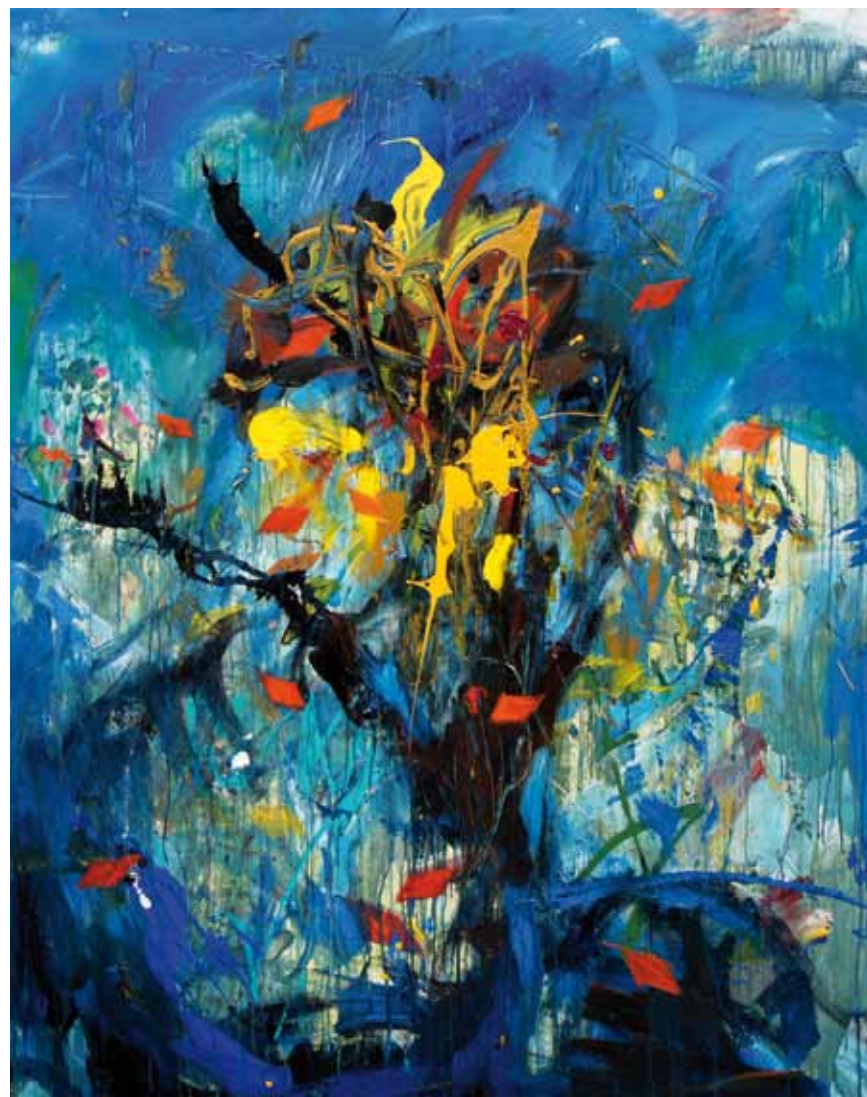
Viotili (Large Dragon 大龍), 2012, acrylic on canvas, 丙希畫 155cm x 122cm