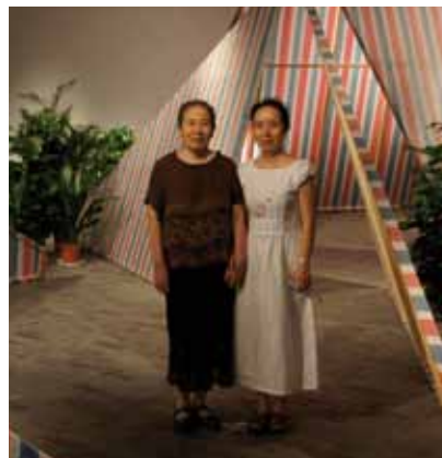
Mother & Daughter 母女