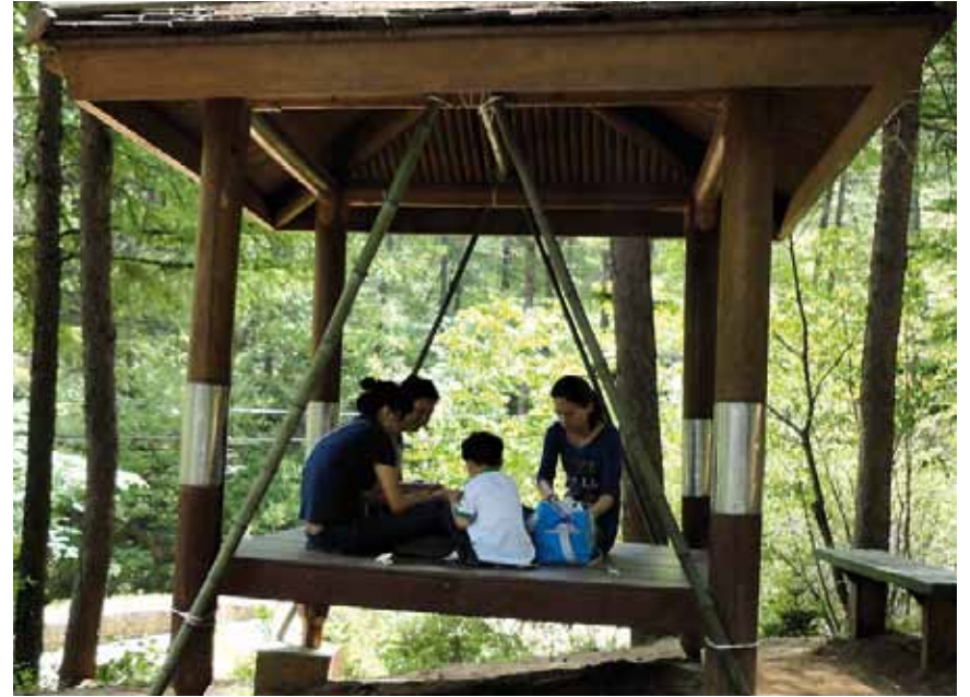
Rocky Railway High (Embarkment) – Eco-Healing International Installation Festival, Mount Kejok, Daejeon, S. Korea, 2011 華工(回航)