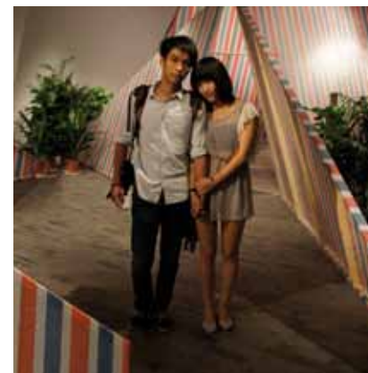
Young Lovers 年輕愛侶