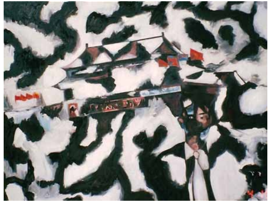
ABSS-Tien-An-Mao, 1998, Oil on canvas, 油畫, 122 cm x 158 cm,