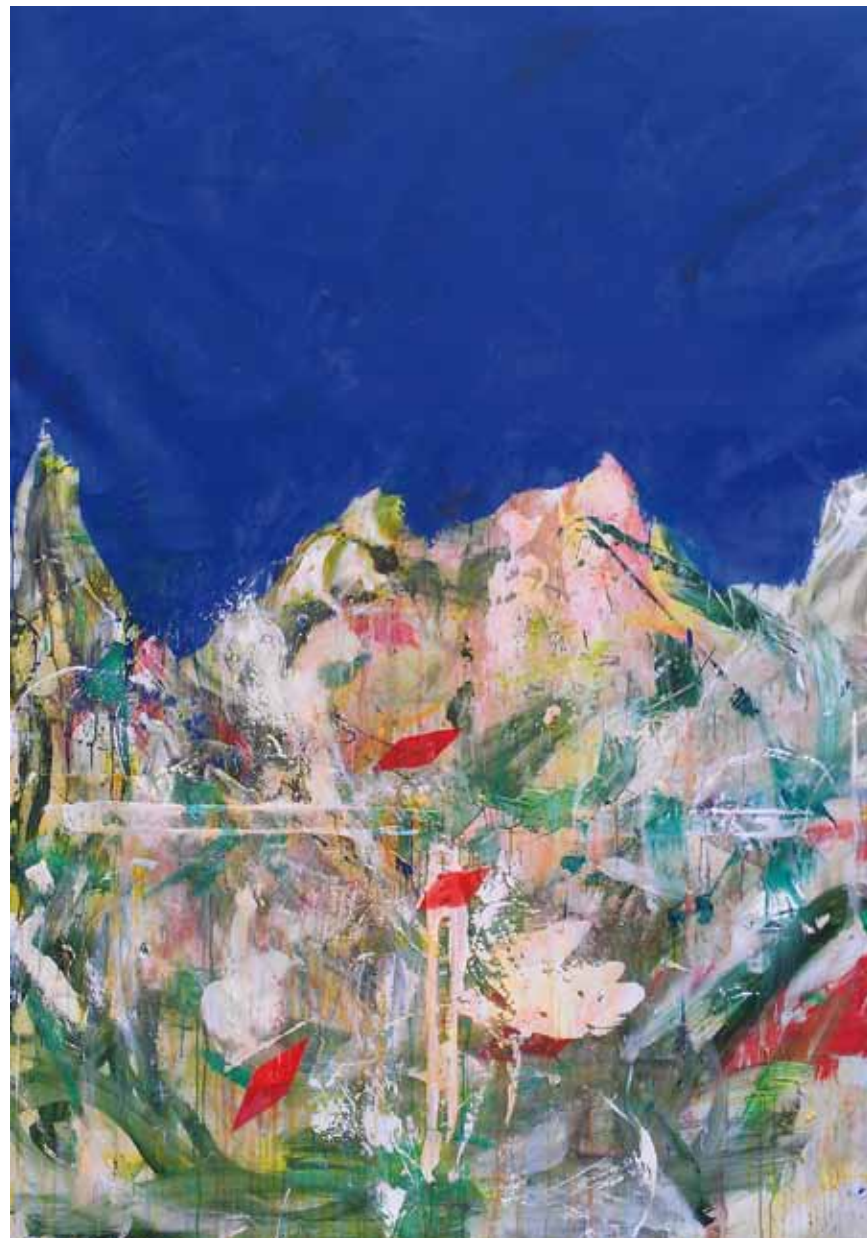
Ningbo (Fan), 宁波 (帆) 2012, acrylic on canvas 丙希畫 193 cm x150 cm