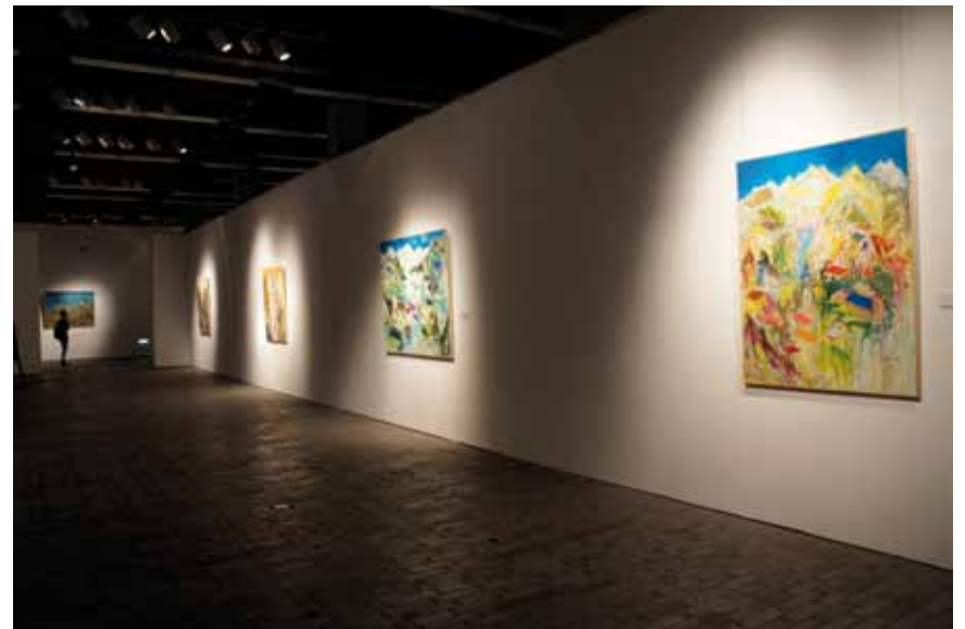
Exhibition installation view. 展覽廳布景.