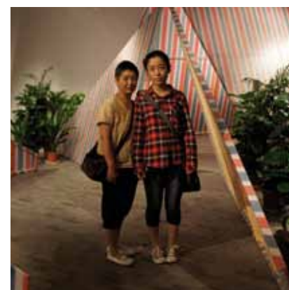
Aunt & Niece 姨侄