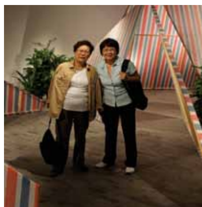
Traveling Companions 旅伴