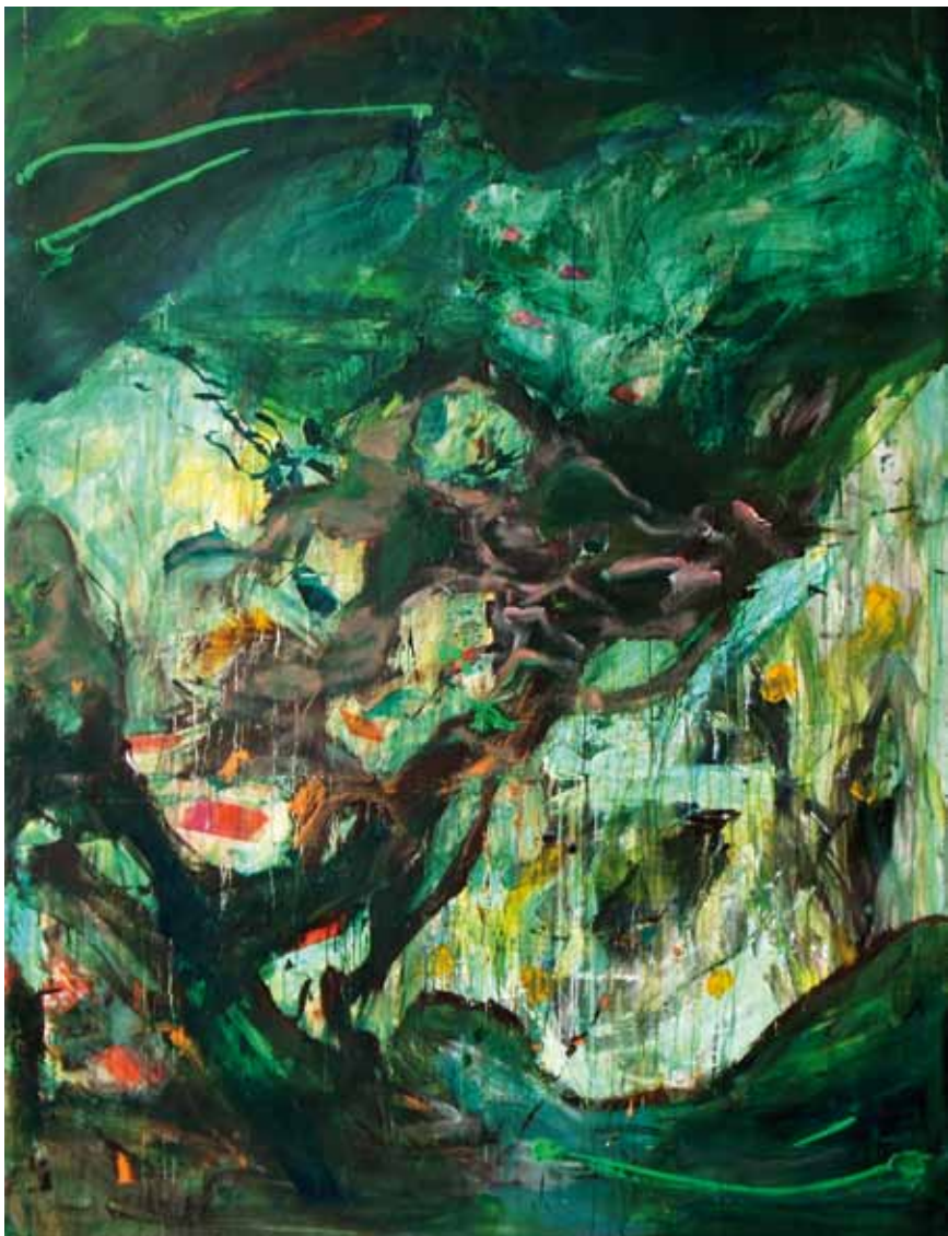
Ningbo (Peng) 宁波 (平), 2012, acrylic on canvas 丙希畫 193 cm x150 cm