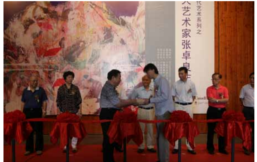
Submissions by Canadian public delivered to City of Guangzhou official. Chinese railway workers symbolically returned home. 張卓良將公眾作品交給廣州市代表，象徵華工回歸故鄉。

Cover 封面: And A Village 又一村 (rayn 雨), 2013, acrylic on canvas 丙希畫 155cm x122cm