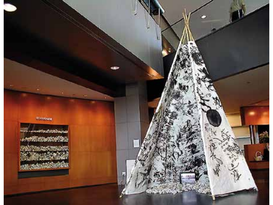
Power to The First People, CAFKA (Contemporary Art Forum Kitchener & Area), Kitchener City Hall, Kitchener, Canada, 2002 第一人民力量