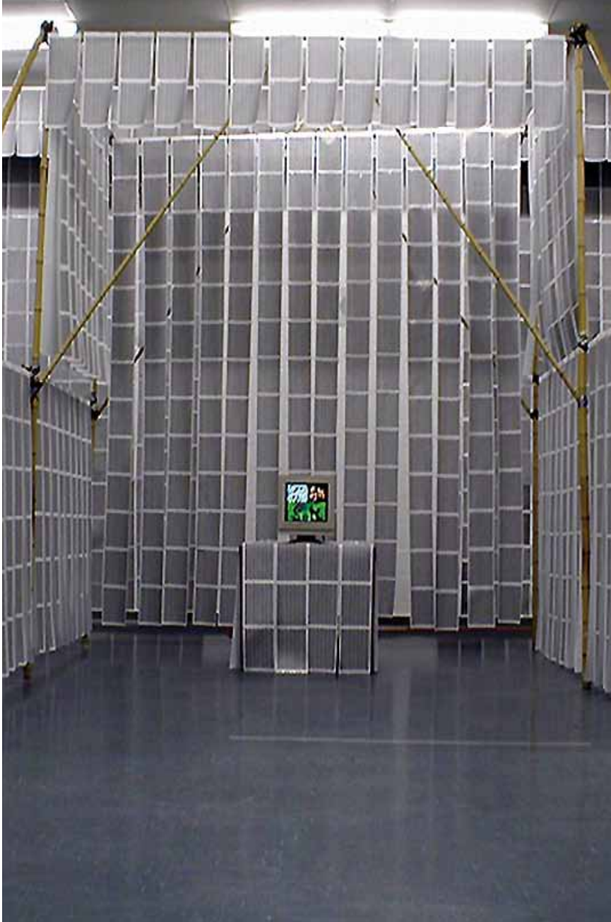
I Would Have Died 3,000,001 Times in 1993 Alone If I Did Not Quit Smoking, Toronto Education Week, 2002 藝術反煙