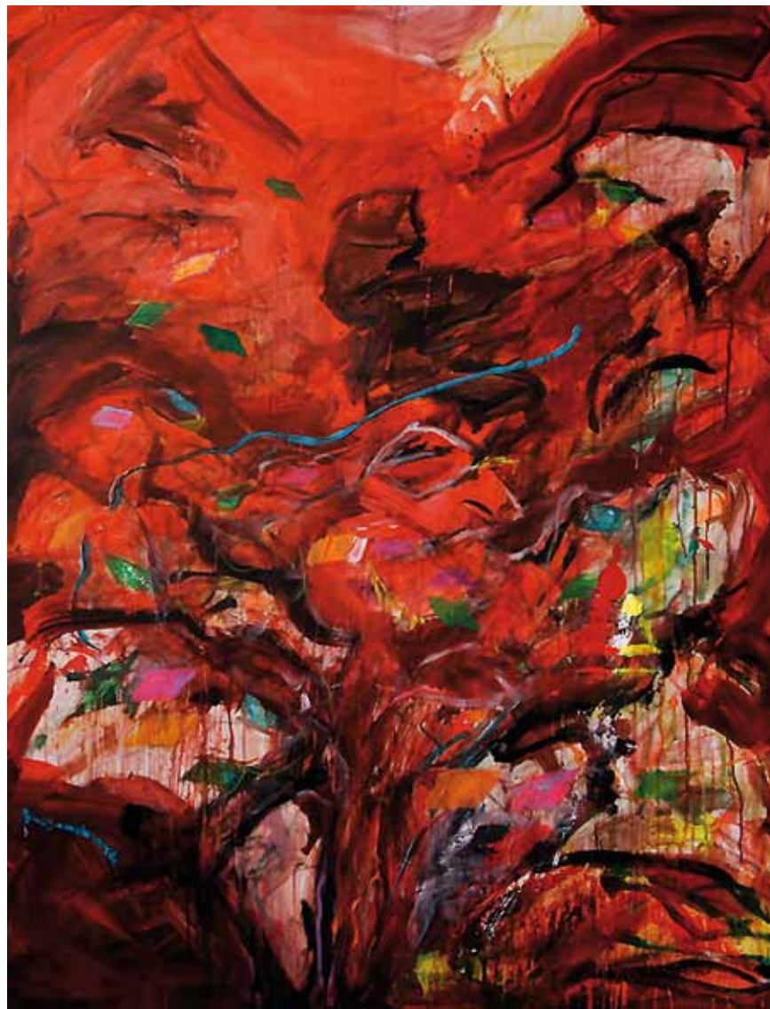
Ningbo (Shu), 宁波 (舒) 2012, acrylic on canvas 丙希畫 178 cm x 147 cm