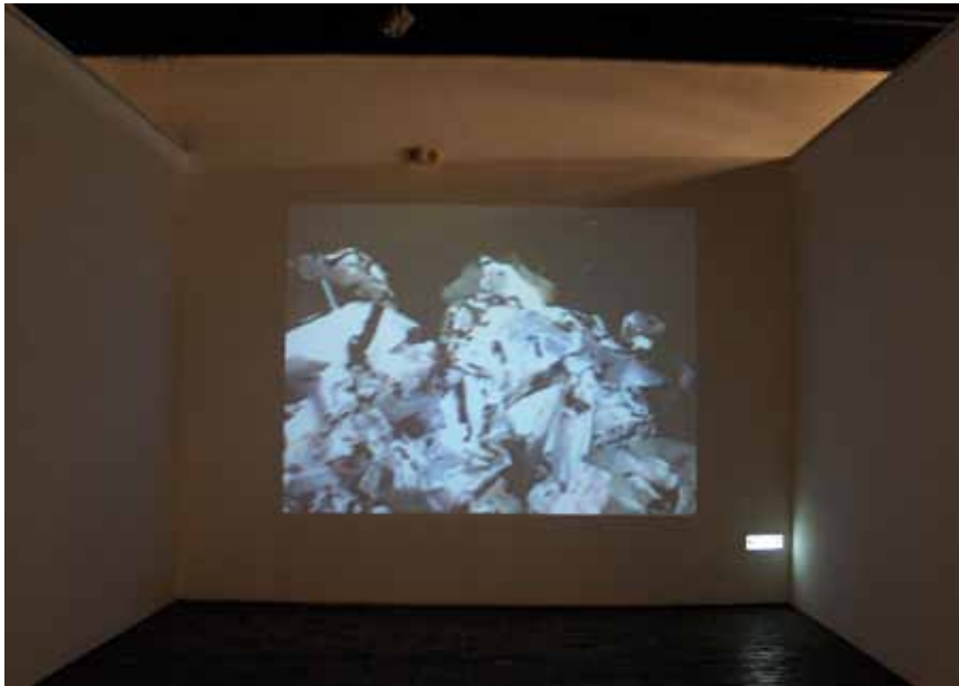
Offloath, 土著的力量 (給予浮動)- 2002 - Video 視頻