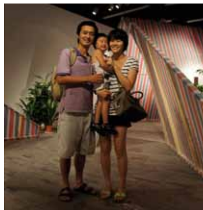
Young Family 年輕家庭