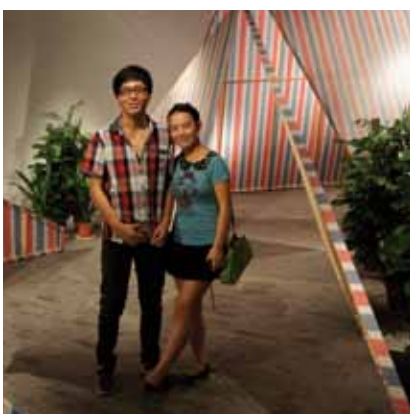
Brother & Sister 姊弟