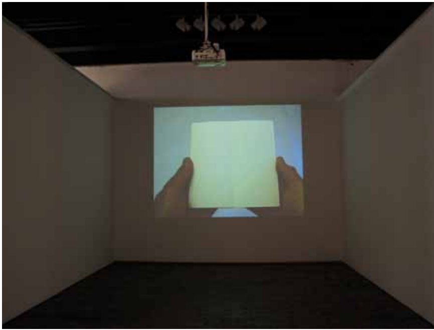
Quanyin Jin (White on White) 觀音經 (无字天書) - Video 視頻.