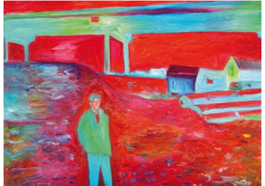
ABSS- Bridge-On-time, 1998, Oil on canvas, 油畫, 61 cm x 91cm