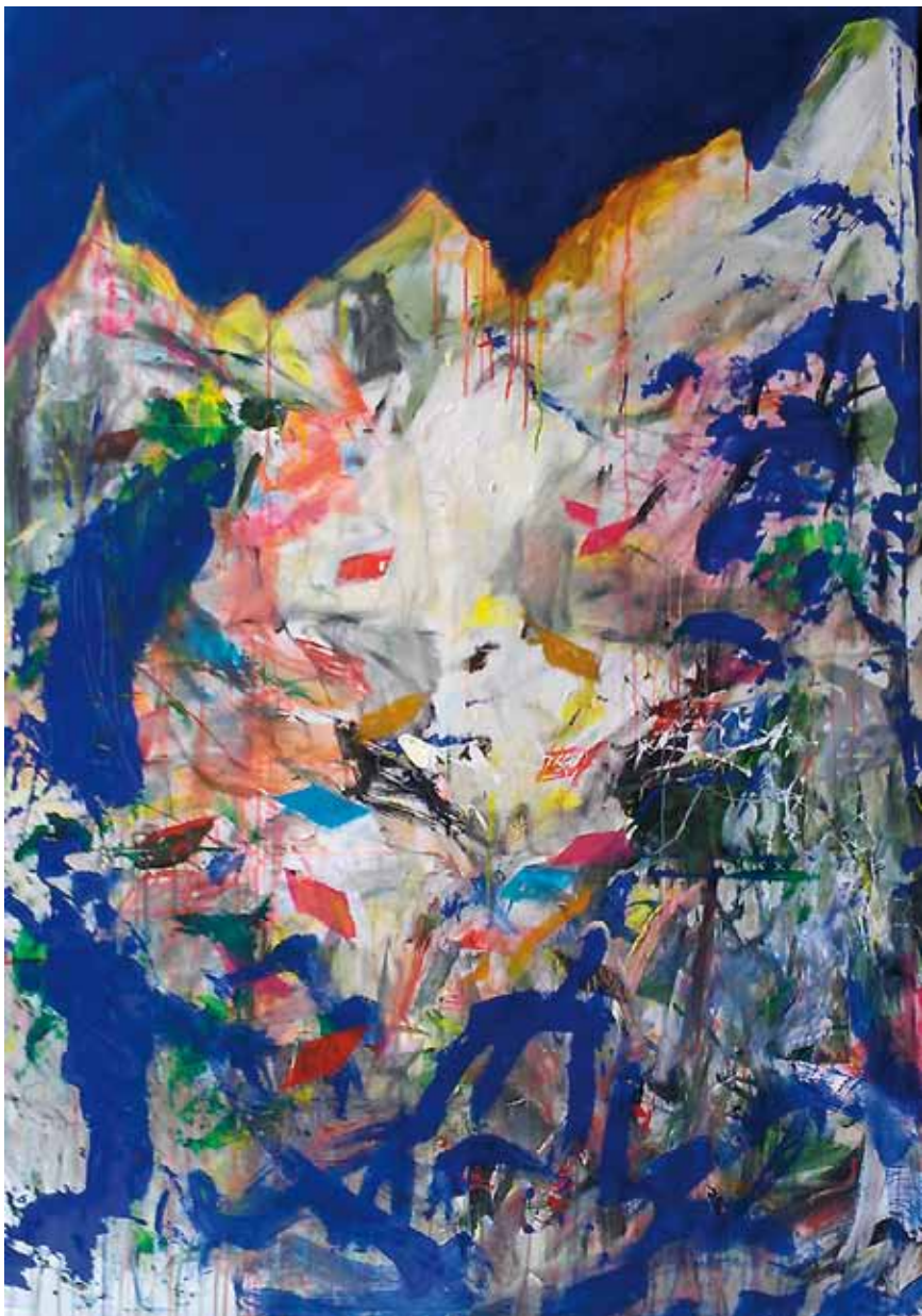
Ningbo (Wei), 宁波 (未) 2012, acrylic on canvas 丙希畫 193 cm x150 cm