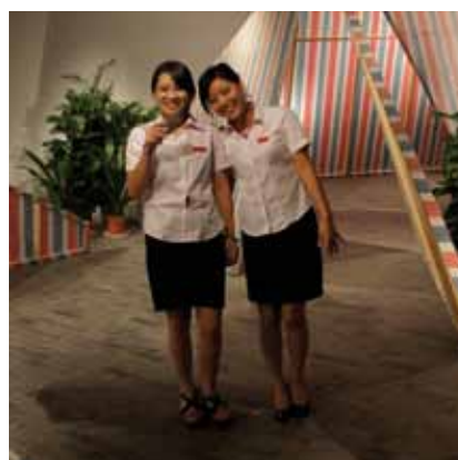
Close Friends 好友