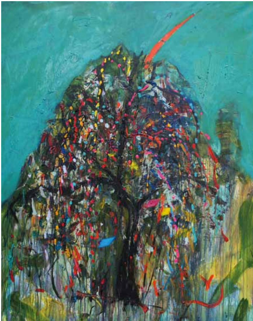
Vitiwinita (Little Dragon 小龍), 2013, oil & acrylic on canvas. 丙希畫 140 cm x 109 cm